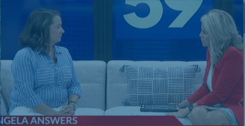
IGELA ANSWERS DOMESTIC VIOLENCE AWARENES